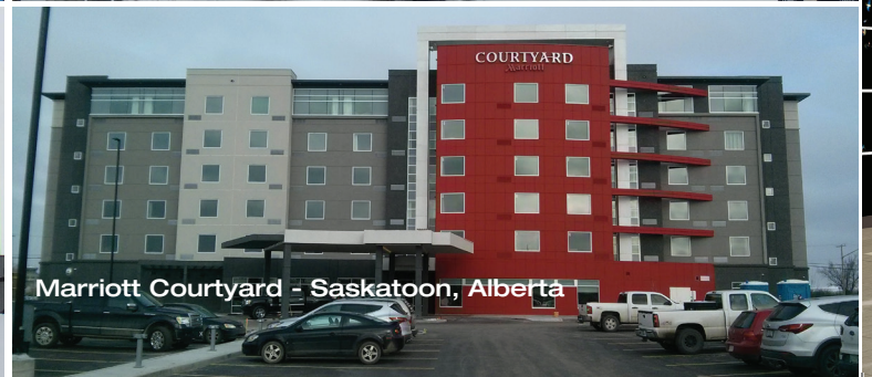
Marriott Courtyard - Saskatoon, Alberta