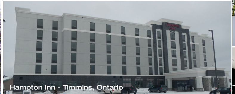
Hampton Inn - Timmins, Ontario