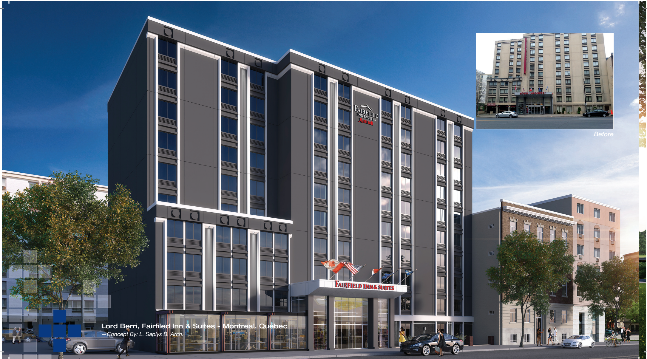
Lord Berri, Fairfiled Inn & Suites - Montreal, Québec — Concept By: L. Saplys B. Arch.