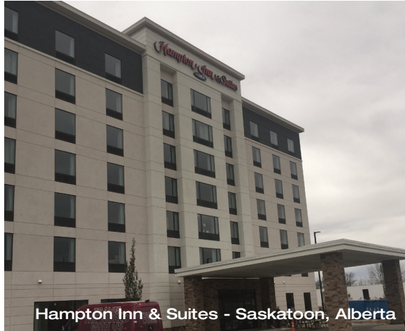
Hampton Inn & Suites - Saskatoon, Alberta