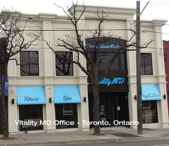
Vitality MD Office - Toronto, Ontario