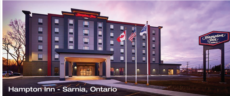
Hampton Inn - Sarnia, Ontario