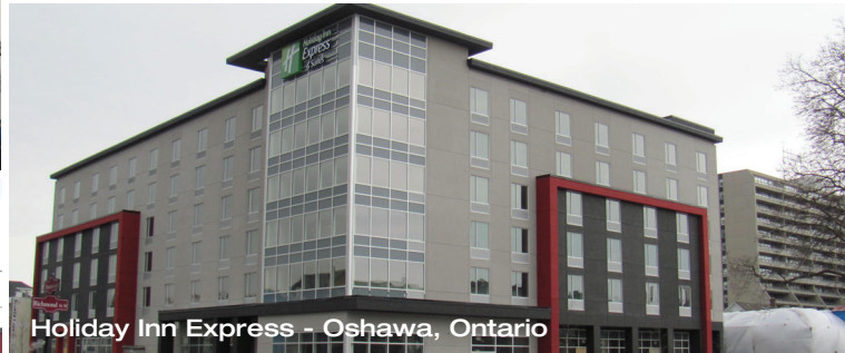
Holiday Inn Express - Oshawa, Ontario