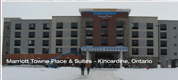
Marriott TownePlace & Suites - Kincardine, Ontario