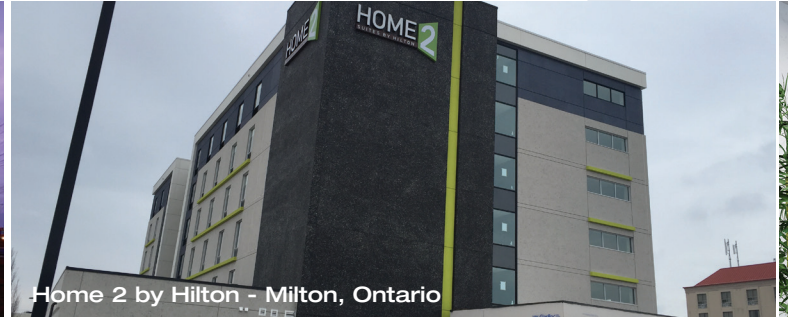
Home 2 by Hilton - Milton, Ontario