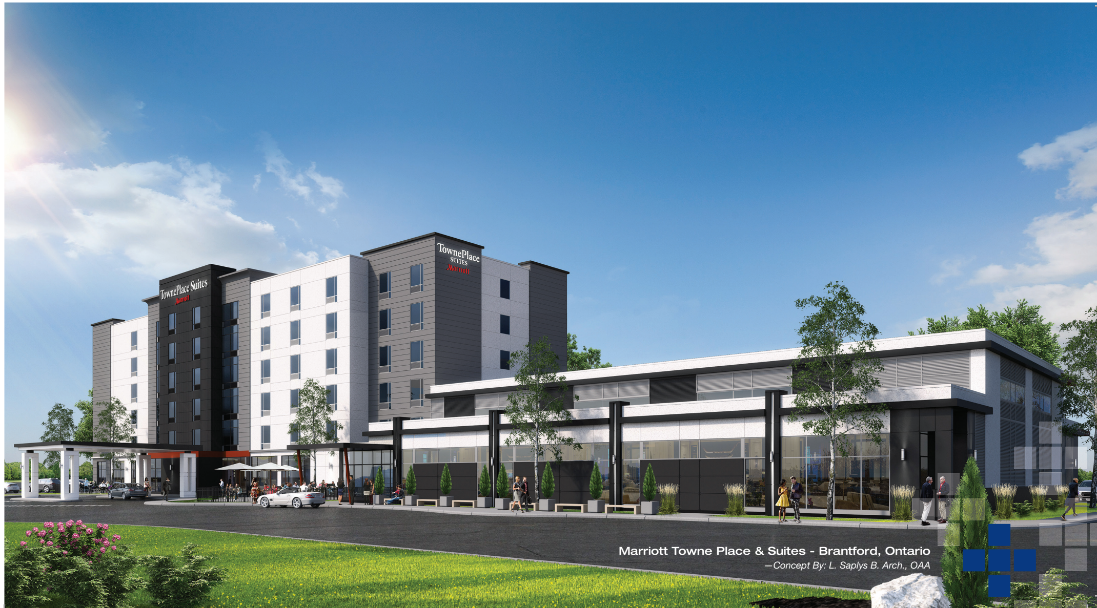
Marriott Towne Place & Suites - Brantford, Ontario